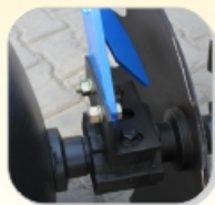
Heavy duty SGRN bearing hub