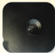
Gang axle Lock